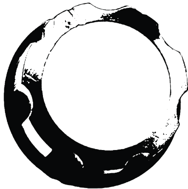
Pittsburgh Modular Synthesizers